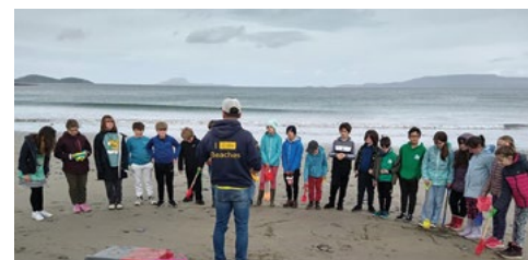
Holy Trinity National School, Westport, Co. Mayo