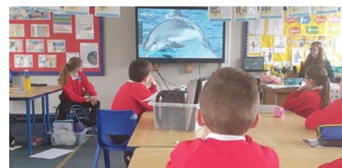
Labasheeda Projects Group, Co. Clare