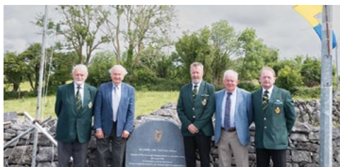
Kilkeedy Community Group, Co. Clare