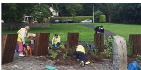
Cabinteely Tidy Towns and Friends, Co. Dublin