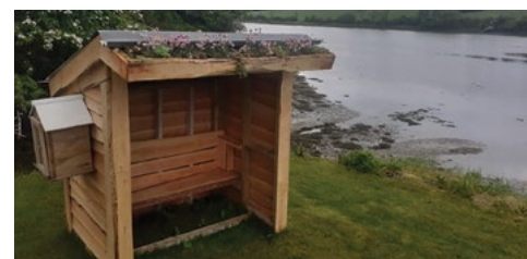
Cloontuskert Development Association, Co. Roscommon